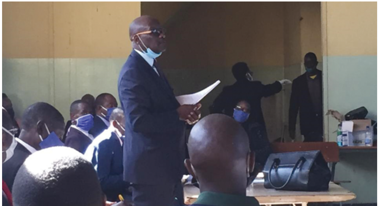
Dr David Parirenyatwa speaking during a Cyber Security Bill public hearing in Luveve

The consultative process which is being done against a backdrop of traverse socio-economic