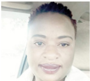
PROOFREADER: Runyararo Chilenje