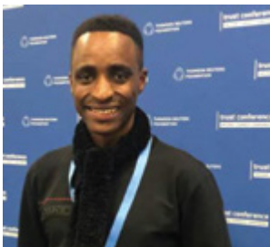
SUB-EDITOR: Nqobizitha Donga