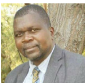
CORRESPONDENT: Shadreck Ncube