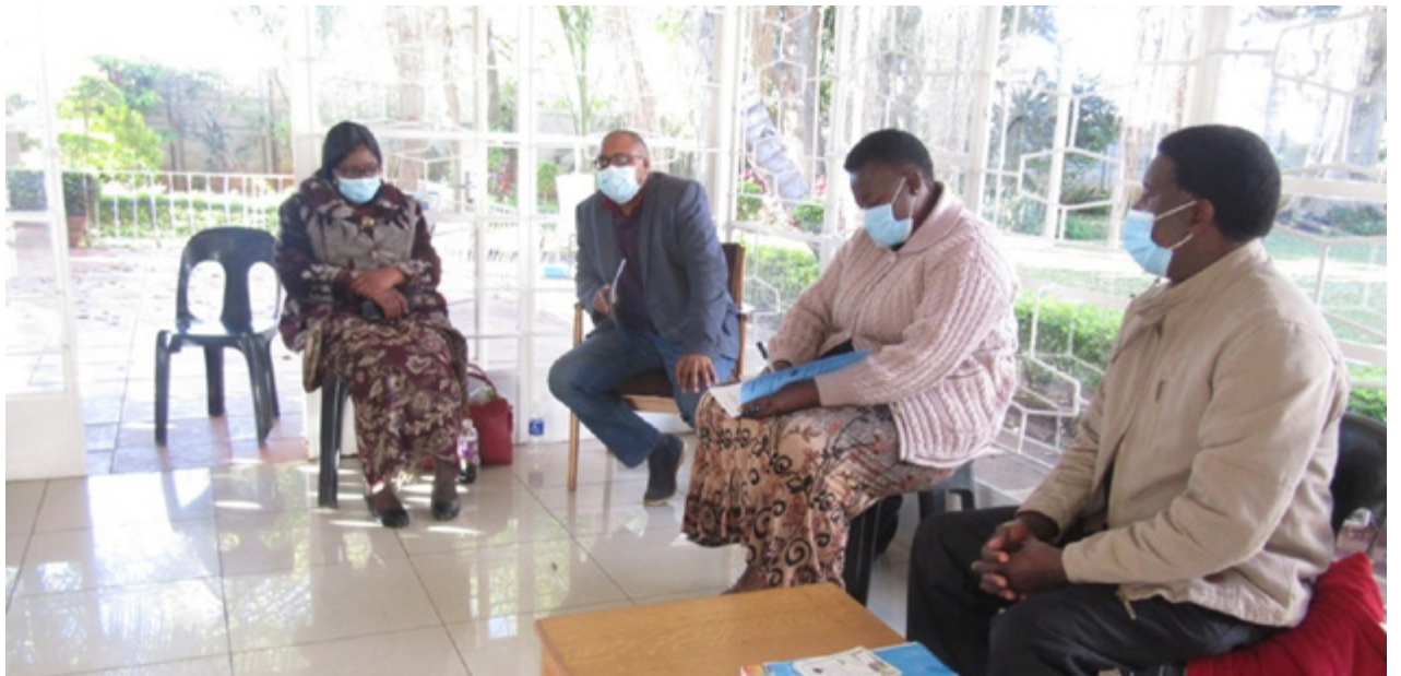
Psychosocial Support Skills training for church leaders in Bulawayo