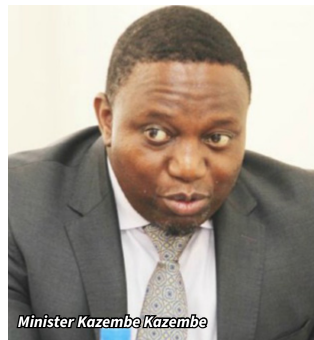
Minister Kazembe Kazembe

“The Civil Registry department in consultation with the Attorney general and the Ministry of Justice, Legal and Parliamentary Affairs is working out modalities to avail death certificates to all those in need of the documents,” read the statement.