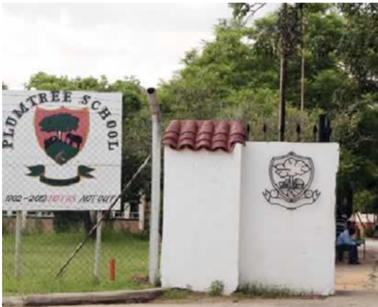
Plumtree High School

Website: www.zimbabwechristianalliance.org.zw