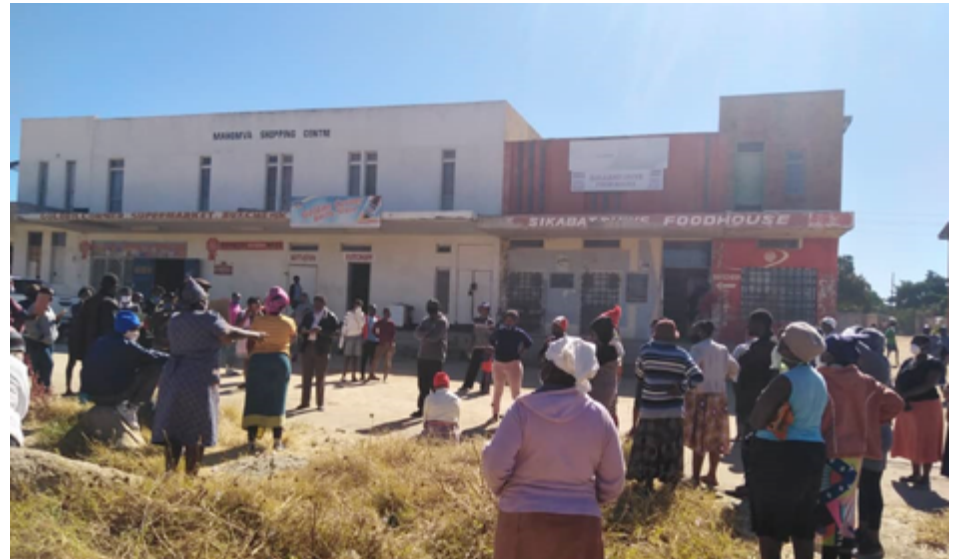
Mpopoma residents protest demanding local shops to accept bond notes

R esidents of Mpopoma, Bulawayo today took to the streets demanding local shops to accept bond notes as they are still rendered as legal tender by the Reserve Bank of Zimbabwe (RBZ).