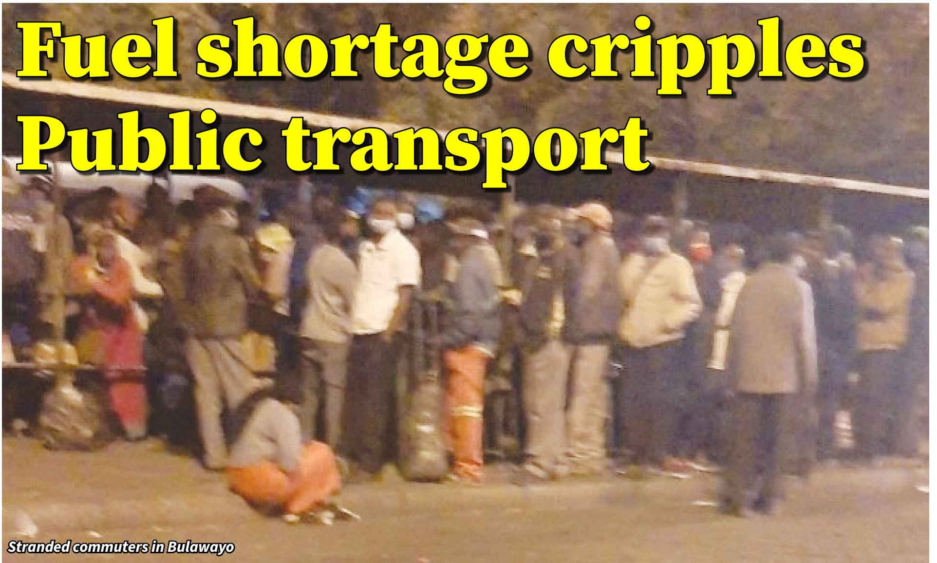
Stranded commuters in Bulawayo

A cute fuel shortage has left commuters in Bulawayo stranded for the past two days as Zupco buses and kombis failed to get the precious liquid.